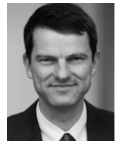
Customer Relationship Born in 1963 Pool member since 2006