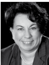
HR-Management Born in 1967 Pool member since 2009