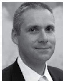
Project Lead eCommerce Born in 1961 Pool member since 2004