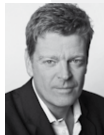
Marketing/Branding Born in 1962 Pool member since 2007